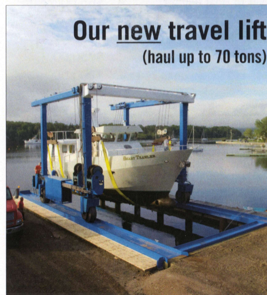
Our new travel lift (haul up to 70 tons)