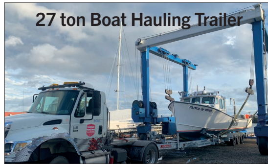
27 ton Boat Hauling Trailer