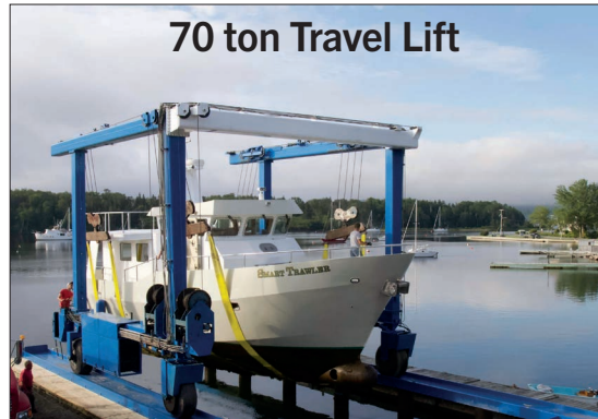
70 ton Travel Lift