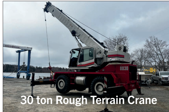
30 ton Rough Terrain Crane

Baddeck Marine 23 Water St., PO Box 420 Baddeck, Nova Scotia B0E 1B0 902-295-2434 Phone 902-295-2379 Fax service@baddeckmarine.com www.baddeckmarine.com